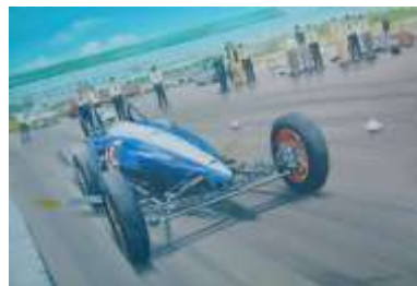
Paul Whitehouse 2