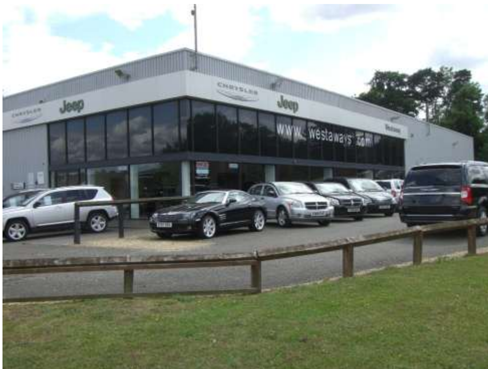
Westaway Motors Chrysler Jeep dealership in Northampton