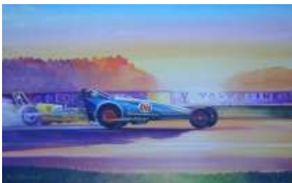
Paul Whitehouse 1